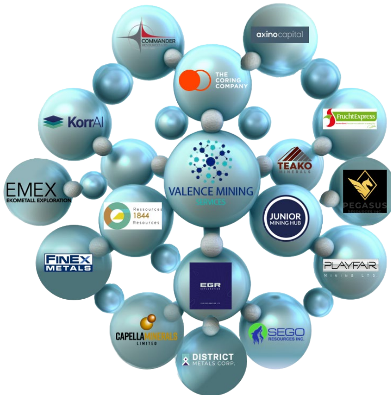
Illustration 1 - Current Service Alliance Members: